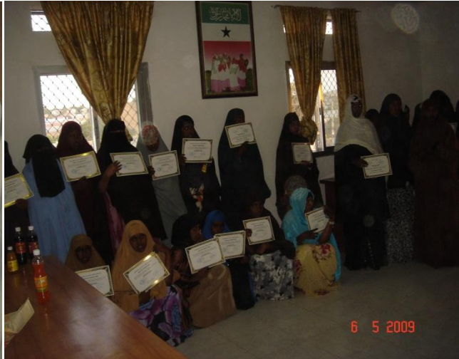
Photo of girls taught reading and writing