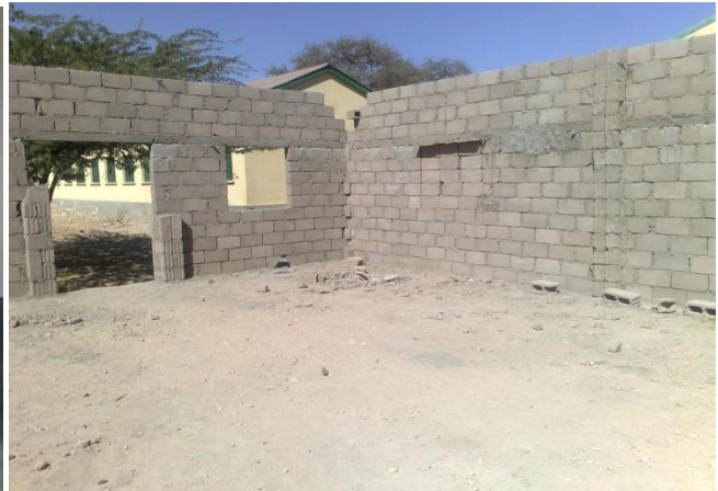
Photo of library opened and the construction of new hall of library.