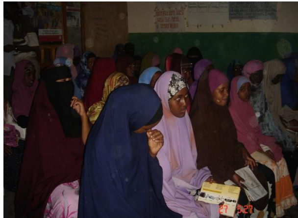
Photo of girl's promotion education center of Hayvo.