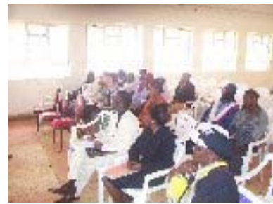
NAYD Summit 2007